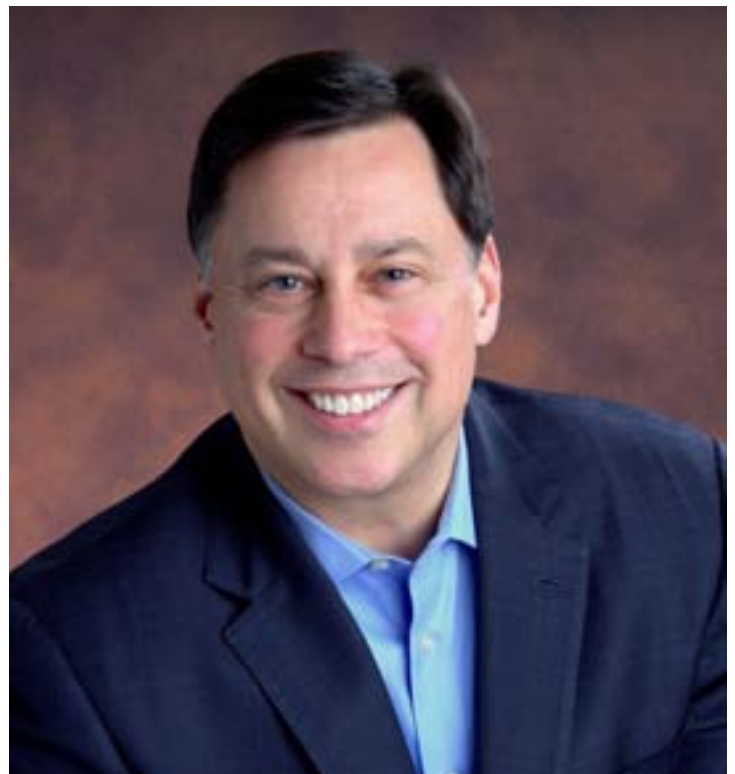
Brad Duguid, Minister of Economic Development, Employment and Infrastructure

Brad Duguid, Minister of Economic Development, Employment and Infrastructure, says the RCCAO has made a significant impact since forming 10 years ago. In a statement, the Minister says: "The government of Ontario would like to thank RCCAO for their advocacy in smart, strategic infrastructure investments. We know that investing in our infrastructure creates construction jobs, but it also creates the backbone of a modern economy and allows people, products and services to move